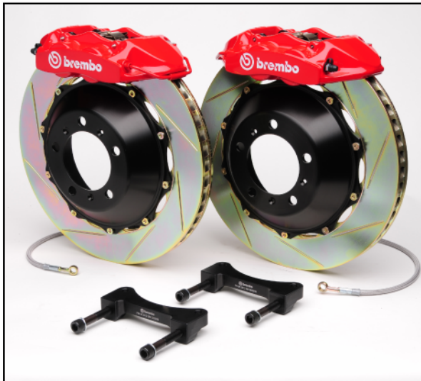
4 piston caliper

Note: front GT kit is designed to work with the O.E. rear brakes. All kits come with caliper brackets, hardware, and brake lines. Caliper colors include black, red, silver and yellow. Maserati logos available at extra cost.